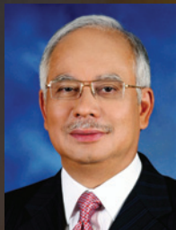
To be officiated by YAB Dato' Sri Mohd Najib bin Tun Hj Abd Razak Prime Minister of Malaysia

29 - 31 July 2010 | Kuala Lumpur Convention Centre