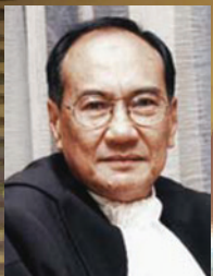
YAA Tun Dato' Seri Zaki Tun Azmi Chief Justice of Malaysia