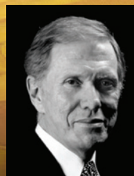
The Honourable Michael Kirby Retired High Court Judge of Australia