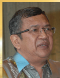
YBhg Tan Sri Abdul Gani Patail Attorney-General of Malaysia