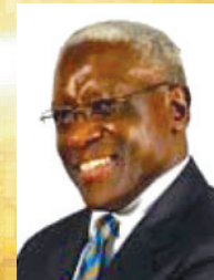
Chief Justice Sandile Ngcobo Chief Justice of the South African Constitutional Court