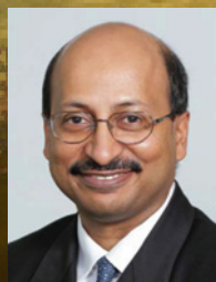
Justice V K Rajah Singapore Court of Appeal Judge